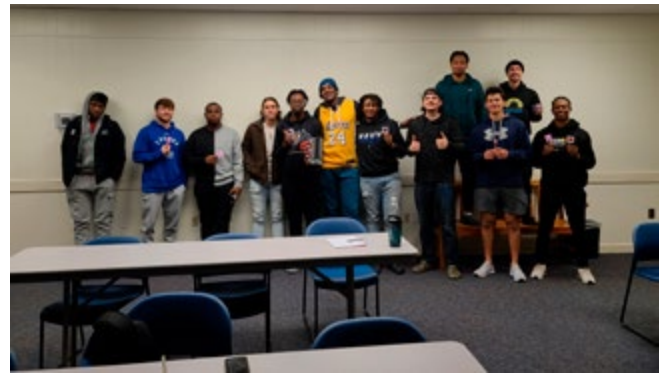
FBLA-C meets with BUS 329, Consumer Behavior.