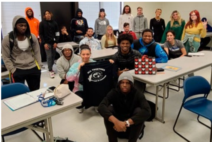
FBLA-C meets with BUS 220, Foundations of Marketing Theory