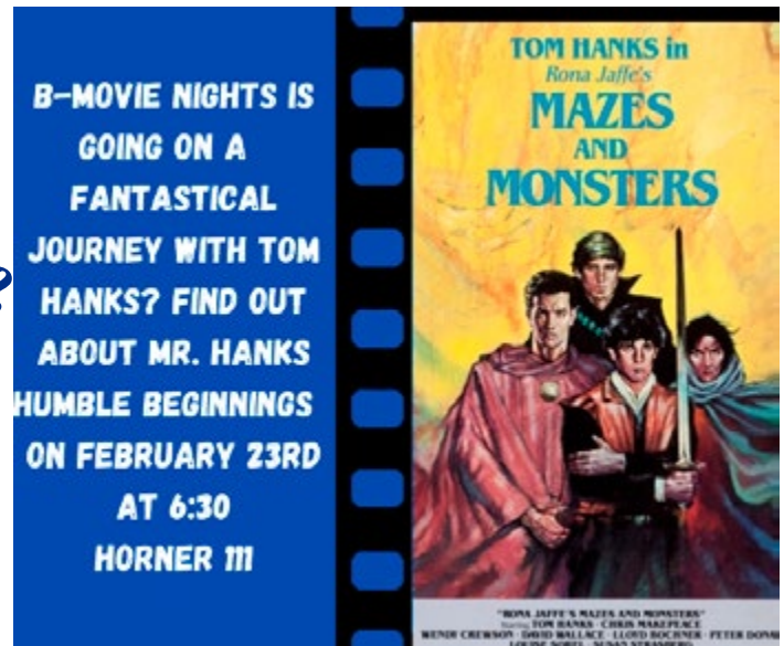
Event promotional flyer

In March, B-Movie night goes back to the action shlock well again for a dose of bad acting that rivals your nephew's third-grade acting ability. Be on the lookout for "The Russian Terminator".