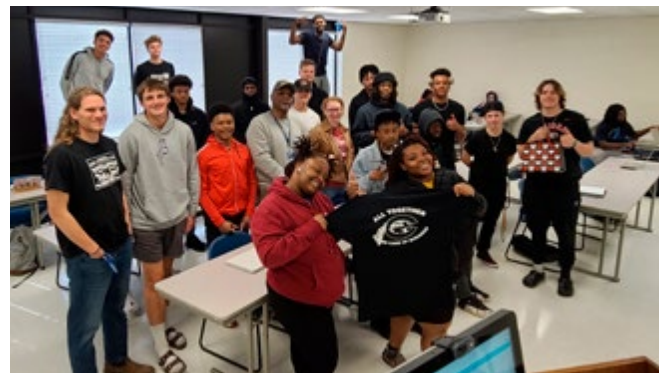
FBLA-C meets with BUS 110, Introduction to Business