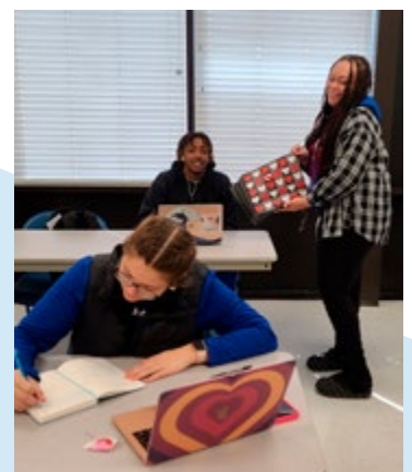
FBLA-C meets with BUS 321, Advertising and Sales Promotion