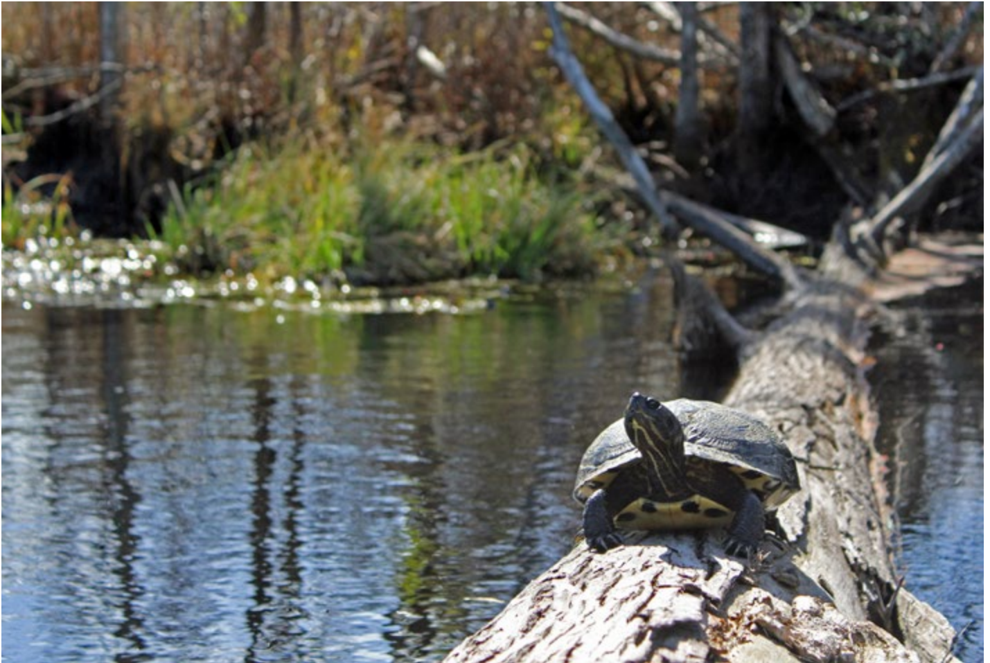
THIRD PLACE: The Perfect Spot , Skadi Kylander