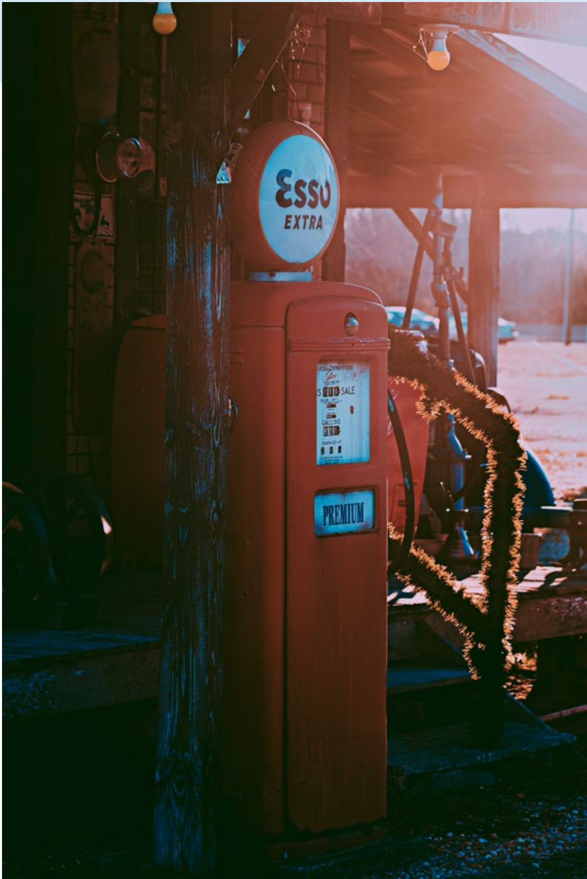
SECOND PLACE: Old Gas Pump, Jyronn Brinkley