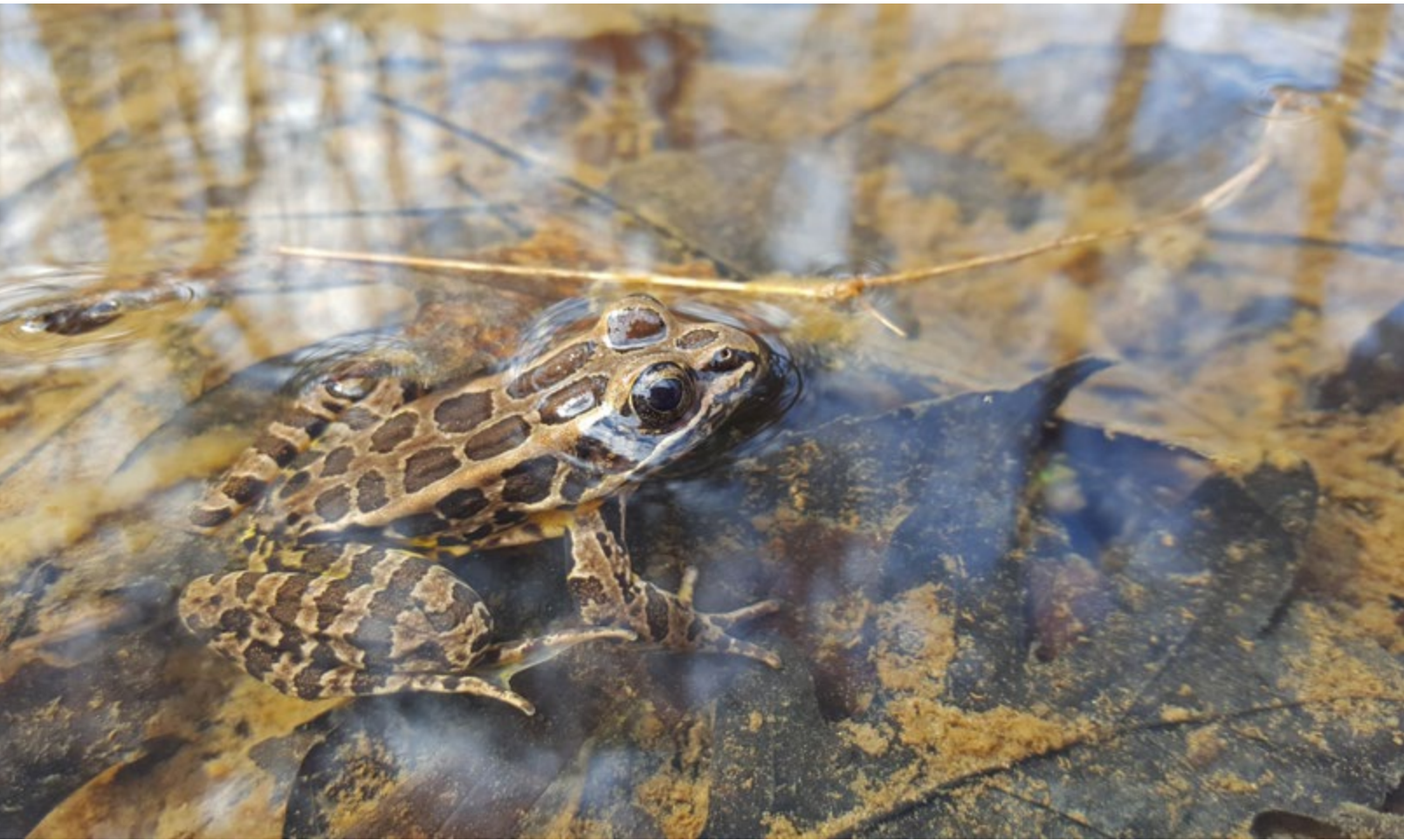
FIRST PLACE & PROVOST'S CHOICE: Lithobates palustris , Skadi Kylander

First Place: Lithobates palustris by Skadi Kylander