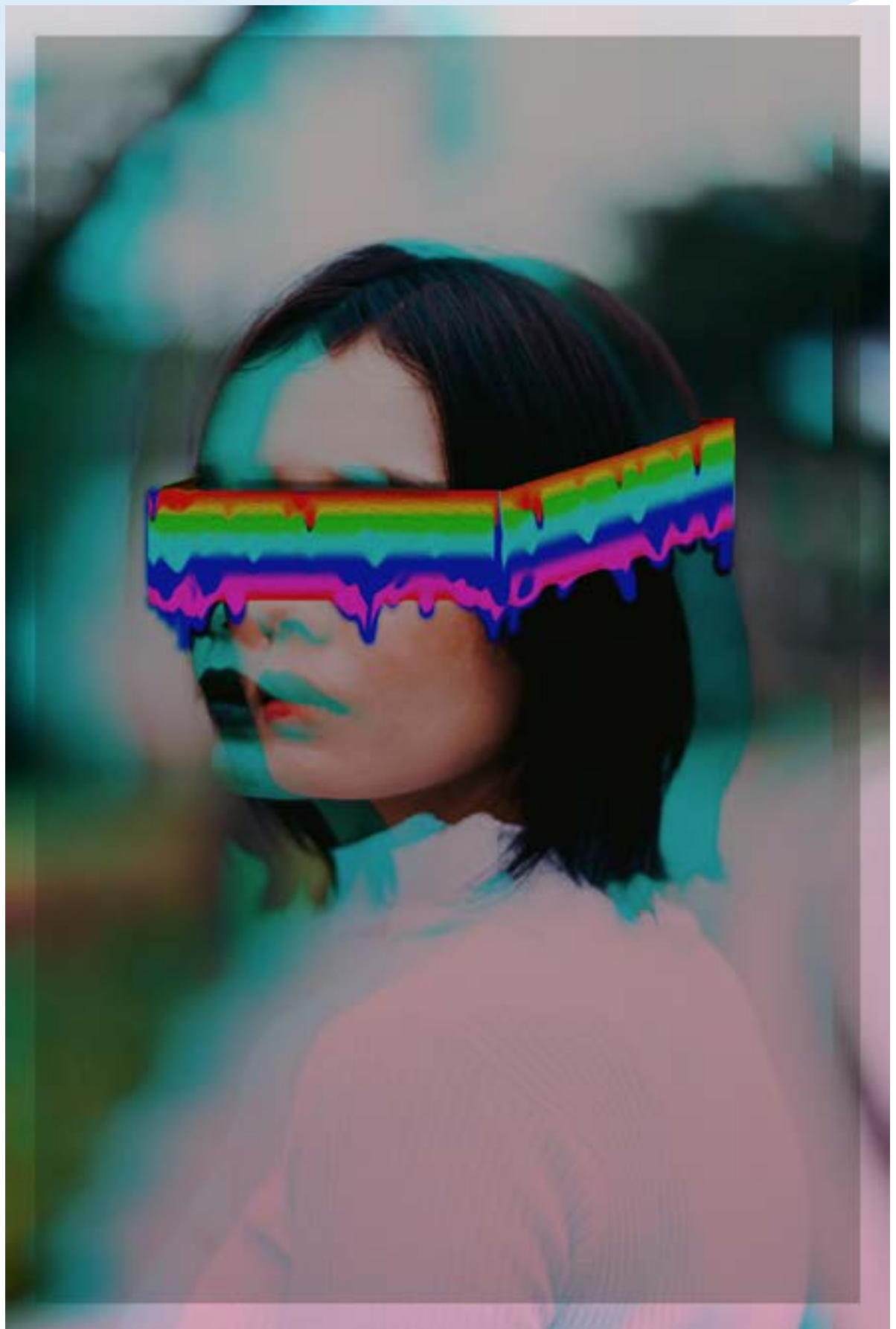
Second Place Charles Kearse Delusional Fantasy Digital Art