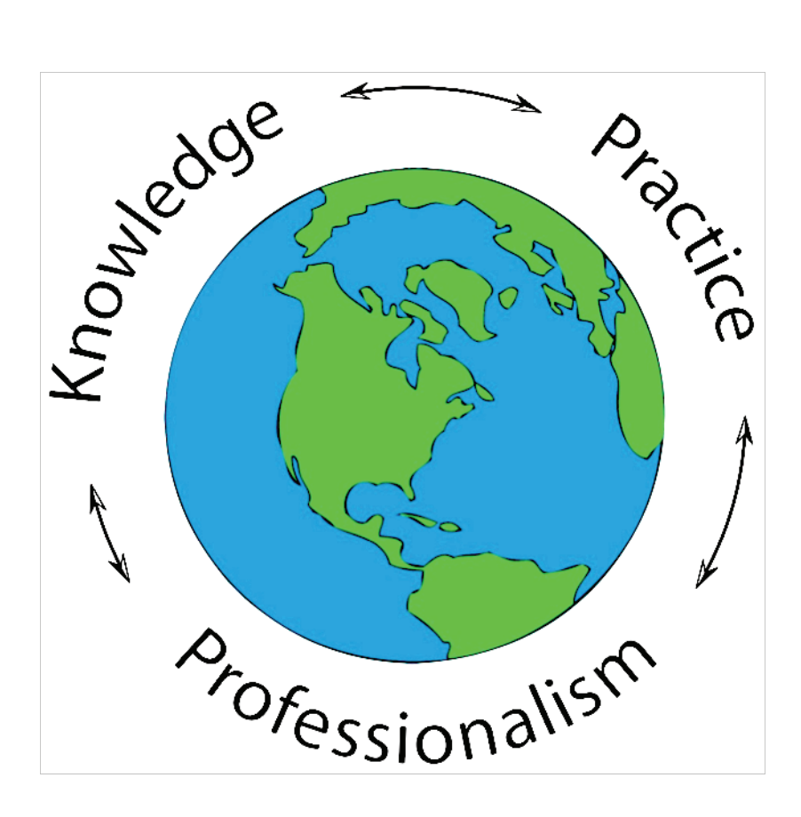
Preparing Committed Professional Educators with Knowledge and Practices for a Continuously Changing World