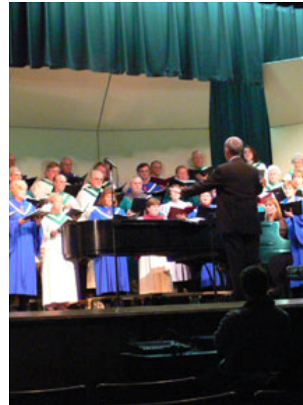
2007 Chowan University Church Choir Festival

The Department of Music invites everyone to attend its upcoming concerts and recitals. More information about these programs is available by calling (252) 398-6201. Admission to all events is free, and the doors open thirty minutes prior to the beginning of each.