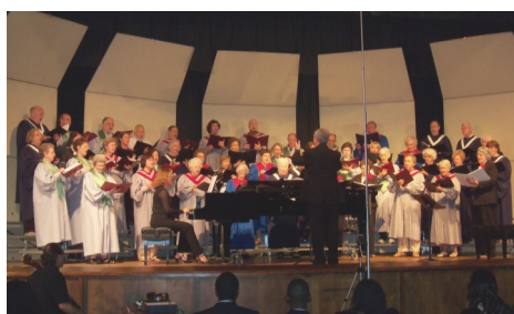
Church Choir Festival Concert September 25, 2010

Chowan Singers presented eighteen concerts throughout the year. In addition to performances on campus, the choir sang for high school and church groups in North Carolina, South Carolina, and Virginia. On its annual spring tour, March 23-27, the choir performed excellent concerts and opened doors of opportunity for Chowan throughout the Mid-Atlantic Region. Cantare sang for five events during the fall semester and took the spring semester off. The group will return to the schedule in the fall 2011 semester. Chowan Chorus continued to provide a great opportunity for students and area residents to lift their voices