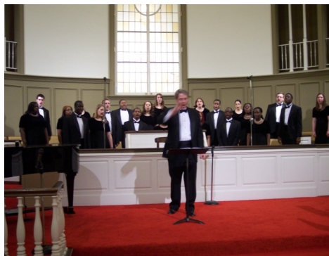
Chowan Singers singing "Now Thank We All Our God" with the audience at Madison Avenue Baptist Church in Goldsboro

The 2010-2011 academic year was a good one for choral music at Chowan. We began with the Biennial Church Choir Festival on September 25, which drew singers from First Baptist Church of New Bern, Indian River Baptist Church of Chesapeake, Murfreesboro Baptist Church, Ridge Road Baptist Church of Raleigh, and Rosemary Baptist Church of Roanoke Rapids. The participants enjoyed an afternoon of rehearsal and fellowship, then performed in the concert that evening. Through the Church Choir Festival, we are able to encourage and equip the people who feel called to minister to their congregations through choral music and to promote the work of the university amongst the churches of our region.