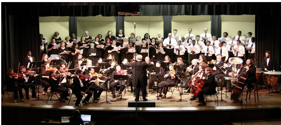
Masterworks Concert—April 18, 2011