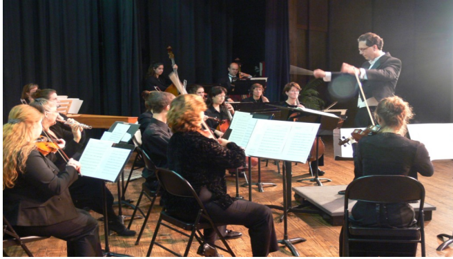
The Meherrin Chamber Orchestra