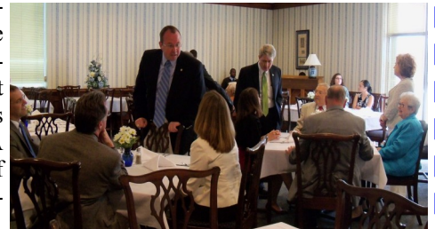
2011 Friends of Music Dinner

Thank you to everyone who gave! We hope you will continue your support and we invite others to join our cause. A gift to the Friends of Music is an investment in our future.